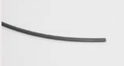
Plastic insert tube for Rollux-Atos mechanism.