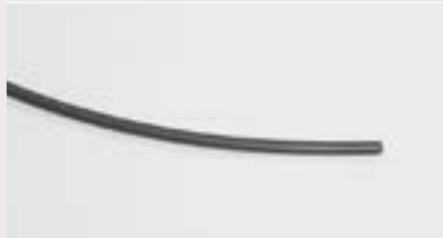
Plastic insert tube for Rollux-Atos mechanism.