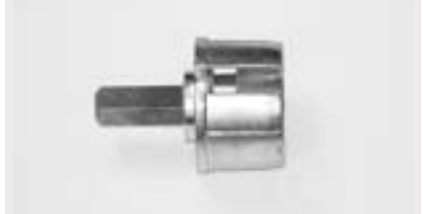
60mm Metal tube end squared tip for Rollux-Atos mechanism.