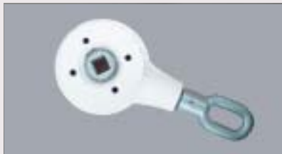
Manual system control 1:3 for Rollux-Atos Mechanism.