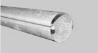
60mm Galvanized roller shades tube with groove for Rollux-Atos mechanism.