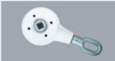
Manual system control 1:3 for Rollux-Atos mechanism.