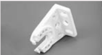
Universal support bracket for Rollux-Atos mechanism.