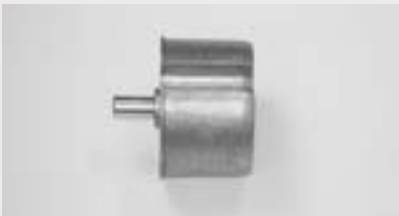
78mm Metal tube end round tip for Rollux-Atos mechanism.