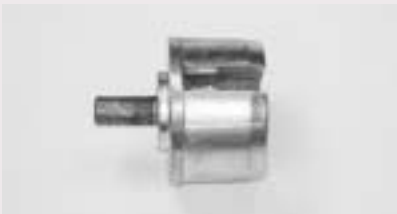
60mm Metal tube end round tip for Rollux-Atos mechanism.