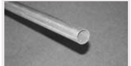
Galvanized metal bottom rail tube for Rollux-Atos mechanism.