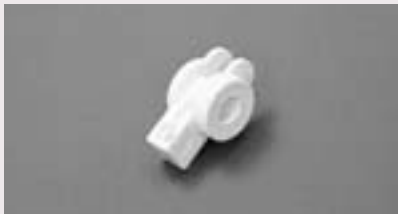
Plastic bearing with screw and nut for Rollux-Atos mechanism.