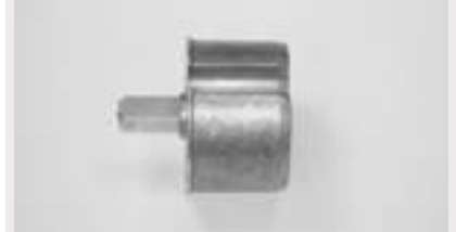
78mm Metal tube end squared tip for Rollux-Atos mechanism.