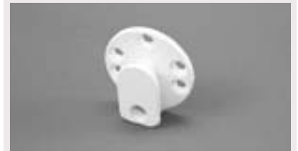
Metal end support end cap white for Rollux-Atos mechanism.